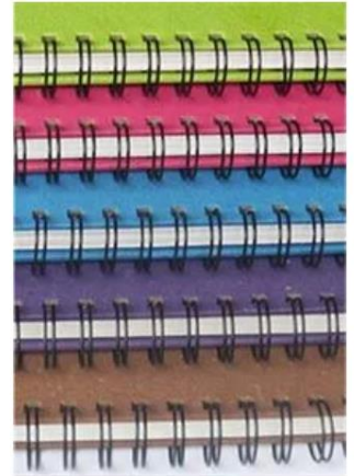
A3 INDIE Sketchbook,