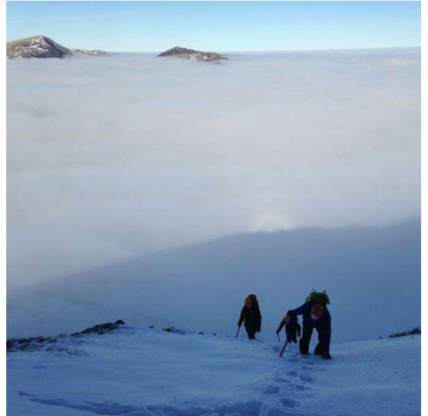
Picture: Students on an ascent to above the clouds in Glen Coe.

No better challenge for our students than to take their prior knowledge and apply it in the wilds of Scotland, in the winter. It is dark, snowy, icy, bleak and incredibly rewarding. This 7-day trip based around Fort William will introduce ice axes and crampons to the students taking them to new heights. Students will use their mountaineering skills and climbing techniques to scale snowy peaks safely. The team will live fully catered in a hostel, with appropriate COVID measures, as such there will be a small cost to the trip to fund boarding and technical equipment, at the moment this is £280 but is subject to change as the accommodation determines how they may open COVID safely. The trip will leave College the Friday before February half term, returning the following Thursday, 12-18 th February 2021. The trip is aimed at students in Year 9 and above.